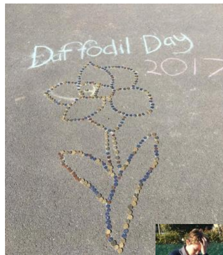
The Student Council organised a Coin Trail, for Daffodil Day, which raised $211.90. The funds will be donated to the Cancer Society.